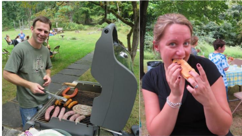
Lots of yummy grilled tube-meat!!